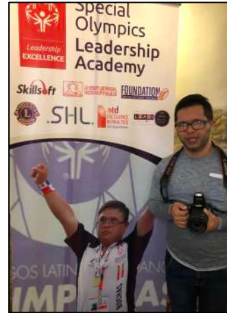
Leader and photographer