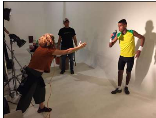
Coca Cola model