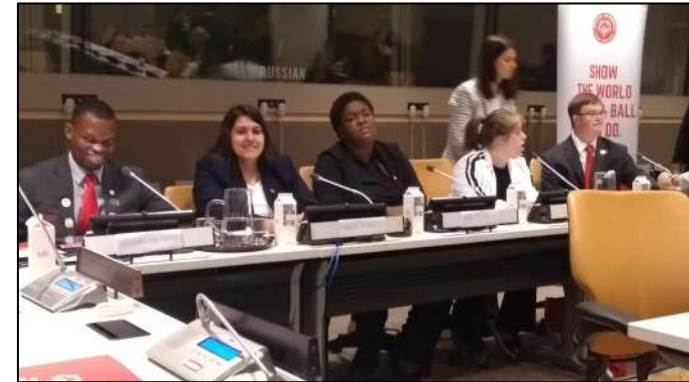
Global Messengers at UN Conference of States Parties to the CRPD