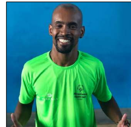
Started as an athlete and now is graduated in P.E. and is coaching athletics